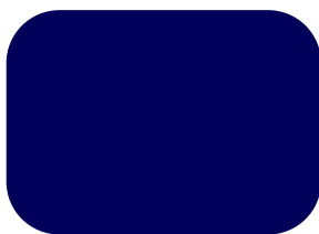
Dark Indigo blue